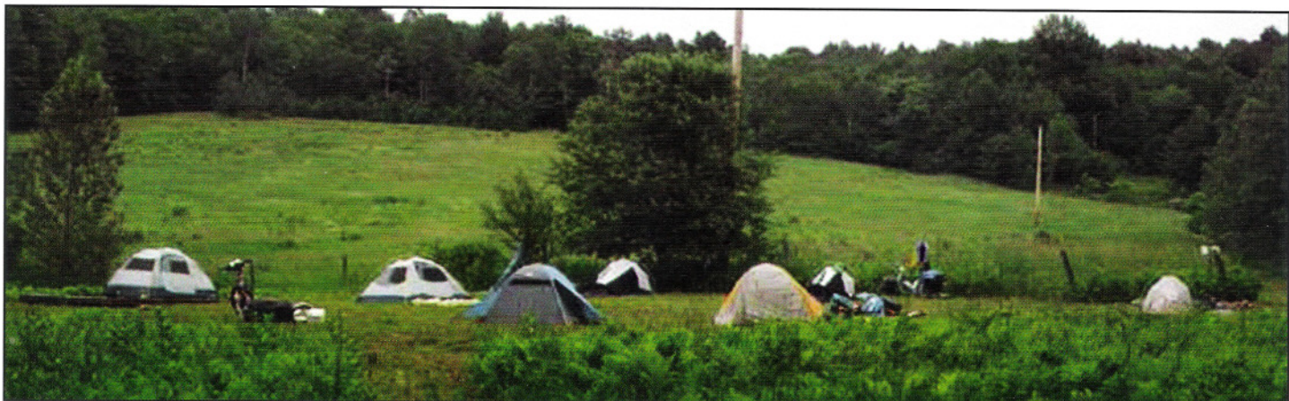
Four Springs Farm

Tucked away in the corners of fields and orchards on a mowed grassy knoll, are the rustic accommodations that Cleland refers to. Open April to October, farm vacationers park remotely and hike in with their belongings. There is a simple wood cabin, designed by Cleland, and built with the help of a local builder, and seven tent sites each featuring a tent platform, fire pit, and picnic table.